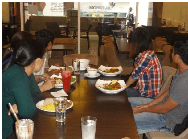
Luncheon with the Refugee Teachers.

“Give a man a fish and you feed him for a day; teach a man to fish and you feed him for a lifetime - Red Indian Proverb”.