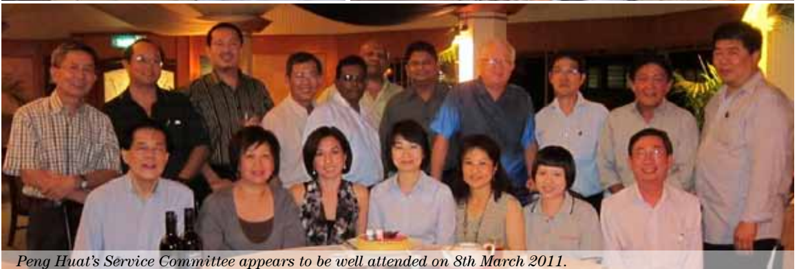
Peng Huat's Service Committee appears to be well attended on 8th March 2011.