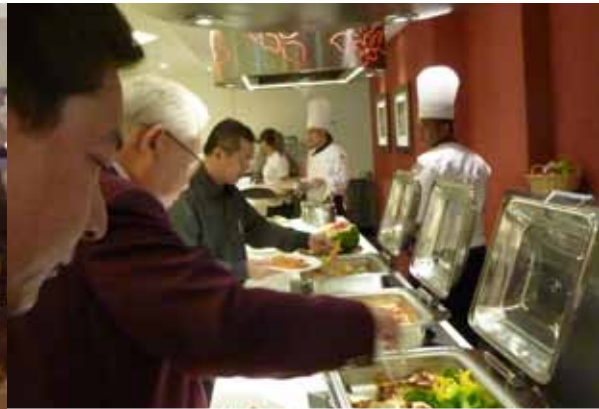
The food was quite nice.