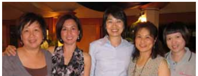
Women's Day celebrations?