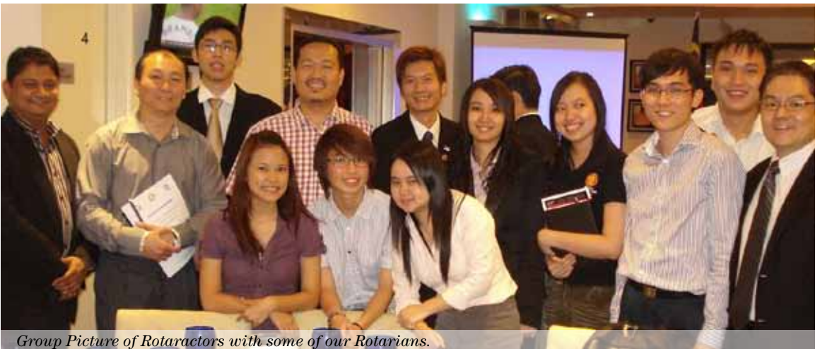
Group Picture of Rotaractors with some of our Rotarians.