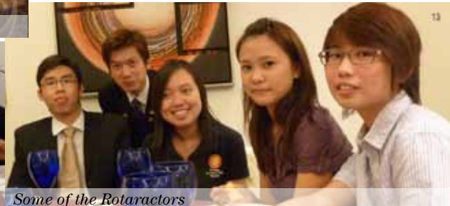
Some of the Rotaractors