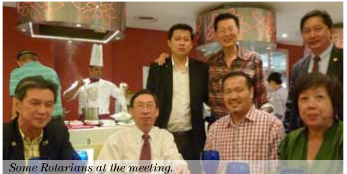
Some Rotarians at the meeting.