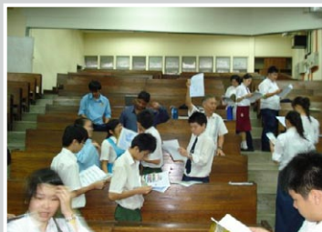
FIRST PRIZE WINNING ESSAY ALSO!