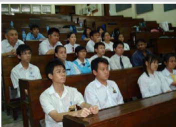
Thanks for the Essay Contest! When is the Elocution Contest?