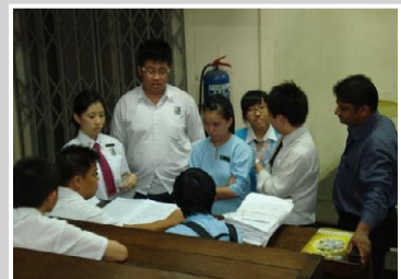
Looking through the Interact District Conference Application and RC Pudu's Application Forms.