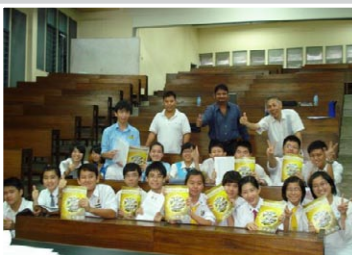
SEE ! WE ARE FEATURED IN THE DG'S NEWSLETTER!