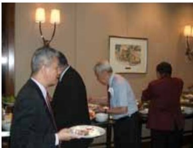
Members enjoying the buffet lunch