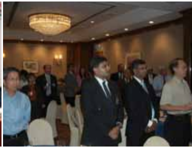
Members standing to attention and singing NegaraKu and for Loyal Toast.