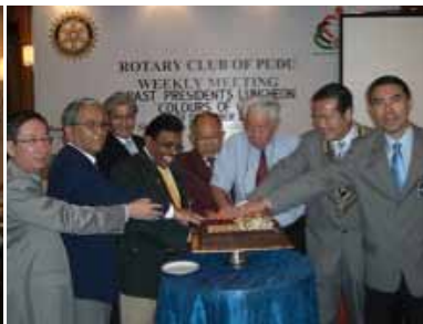
Past Presidents cutting anniversary cake.