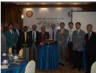
President RY2011-2012 and Past Presidents.