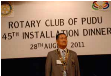
Its lonely at the top.