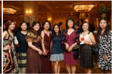
All the ladies looking their best.