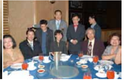
Rotarian from RC Sri Petaling, RC Titiwangsa, RC Gombak and RC Pantai Valley.