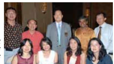
My hiking buddies were there for the occasion.