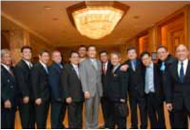
RC Mandaluyong was here in full force.