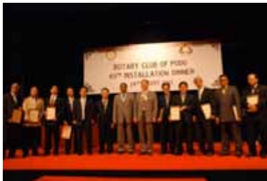
Twenty five years and above of Dedicated and Sacrificial Service to Rotary and Humanity.