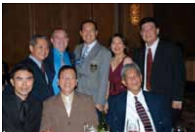
Fellow Rotarians from RC Mandaluyong.