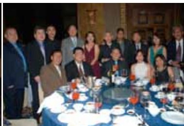
RC Mandaluyong and RC Pudu group photo.