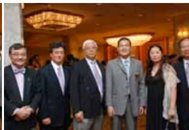
RC Hong Kong Harbour were there too.