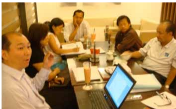
Serious runner were there to assist on the technician.