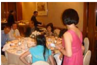
Members enjoying the buffet at lunch.