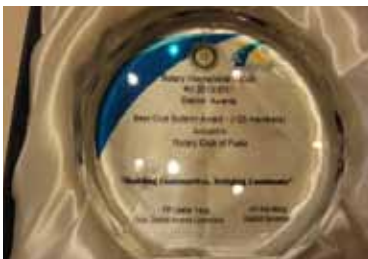
Best Club Bulletin Award