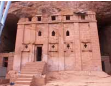
One of many churches hewn into the rocky hills of Lalibela. The town of Lalibela was named after the Ethiopian Saint King that ruled in the late 12th Century AD. He had 13 churches built into the rocks to avoid attacks by Muslim invaders.

Ethiopia is no longer a monarchy since 1975 and traces its history to the 980 BC. It embraced Christianity in the 4th Century AD and is one of the oldest orthodox Christian churches in the world. In 615 AD, Islam came to Abyssinia (Ethiopia) brought by Prophet Mohammad's early followers who came to seek help and advice from the King of Aksum as they were being persecuted by the pagan Quraish Arabs. They were given sanctuary by the King. Presently, however, Christian Ethiopians are in the majority (two thirds of the population). But the government separates religion and state and the two religions co-exist remarkably peacefully.