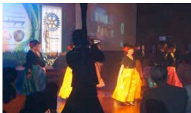
Performance by RC Mandaluyong Anns.