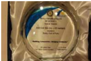
Best Web Site Award