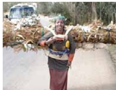
It's only twigs, but hard work nevertheless. This snapshot cost me 1 Dollar (about 15 Birr)

The Ethiopian people are friendly and hard working, the women especially. We saw few hard core beggars but many entrepreneurial types ie sell something in exchange for money. On the road – good road, tarmac and straight – from Moyale to Addis Ababa the fruit vendors (mostly young boys) risked their lives by standing in the middle of the road in the hope of stopping the cars and thus making a sale proposition. I almost hit one boy who jumped sideways in time; it was dusk and they being of dark complexion blended easily with the road. In Gondar, a university town, we had undergraduates offering shoeshine and car wash services for a few Birr (their money). In Lalibela, Aman Yong was so impressed with a youngster who spoke perfect English and was able to rattle off all the capitals of the world by heart. He said he loved geography and wanted to be an astronaut. He was forthright and asked Aman to sponsor him to university. Aman didn't go that far but bought him a dictionary instead.