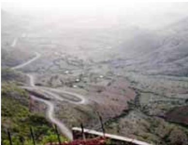
Foggy in late afternoon at 2,500m

I never thought that Ethiopia is a mountainous country. Having been there on this Trans Africa IV expedition driving northward from Moyale to Matema, I now know why Ethiopia is sometimes called the “roof of Africa” because it is on a plateau of height (mostly in excess of 1,500m) and large area (almost three quarters of the country). It is the source of the Blue Nile that flows down to Sudan and Egypt. Geological activity and erosion through millions of years have left many interesting rock formations, fertile valleys and awesome landscapes.