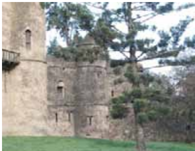
Alem-Seghed Fasil's castle (1632-67) at Gondar. It served as the home of Ethiopia's emperors in the 17th and 18th centuries. Its unique architecture shows diverse influences including Nubian, Arab, and Baroque styles.

Not much is known about Lalibela and visiting it was a bonus for my "Brag List." It was a hard drive to the town, as it was off the main highway. We spent two nights at Lalibela after which we drove on to Gondar for a night and a quick visit to Fasil's castle. And on Wednesday 8 Jun 2011, we crossed into Sudan at the border town of Matema. That will be another story.