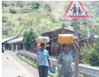
Women carrying water jerry cans on their heads. Those with donkeys carry more and even make a business of it.