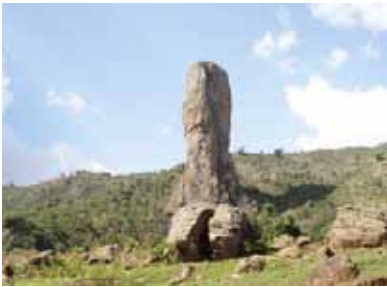
Interesting rock formation

Life, however, is hard especially in the summer months when the rivers dry up. The villages would have to walk long distances to the nearest town to collect water from tankers whose schedules are sometimes not consistent. It is interesting to note that there is a dispute brewing between the Upper Nile countries (Ethiopia, Kenya, Tanzania and Uganda) and the lower Nile countries of Sudan and Egypt over sharing of the Nile waters. Under the Nile Water Agreement crafted by the British colonial government in 1929, Egypt had the lion share of the Nile waters – 55.5bn cubic metres out of a total of 84bn cubic metres of water. The Upper Nile countries that experience drought quite often in the summer months are crying foul. In fact Tanzania has taken steps to build a 169 km (105 miles) pipeline to draw water from Lake Victoria, violating that Agreement. Tanzania claims that the pipeline will benefit more than 400,000 people in