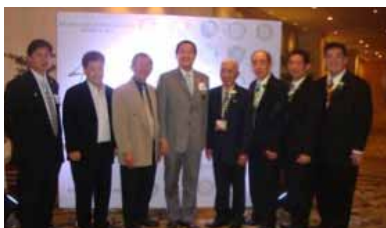
RC Pudu members with RC Mandaluyong members at the photo board.