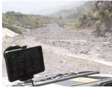
Dried up riverbed. This river is probably a tributary of the Blue Nile which also suffers a falling water level.

towns and villages in the arid north-west of Tanzania. But the water will only be used for people and livestock and not for irrigation.