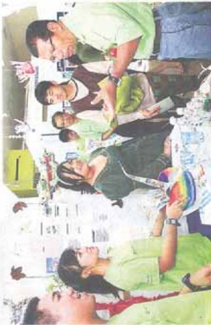
Good job: Pheasal talking to students from SMK Cochrane at their booth.