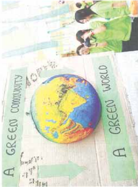
Eye-catching: One of the exhibits on display.

The students effort in getting the public to sign an I-pledge card to save the environment was also a nice effort to create awareness and certainly earned them some extra points.