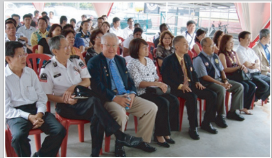
Datin Paduka Chew Mei Fun was on time and the function starts on time at noon at the St John Ambulans Kawasan Pantai Selangor Ambulance Head Quarter.