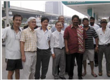
YB Sentaor Kohilan Pillay, the Deputy Minister of Foreign Affairs (in Batik) graciously launched the project on the 1st August 2009 at Jidousha Salon Sdn Bhd, c/o Petronas Service Station, Lot 29071 & 29072, Taman Samudera, 68100, Batu Caves, Kuala Lumpur (next to Giant Hypermart).