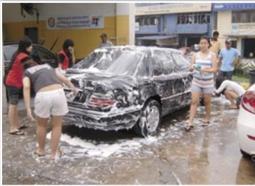
Rotaractors were coached by the Jidousha Salon people to do the right thing.