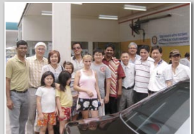
YB Senator Kohilan Pillay the Deputy Minister of Foreign Affairs took a group photos with Rotarians, spouses, family members and the Beacon Life Training Centre, Downs Syndrome children during the launched.