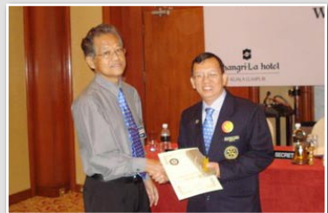
THANK YOU BY PP CHOW TAIN