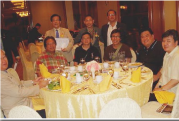
Our 'Sister Club' RC Mandaluyong - another day with us.....missed the flight!!