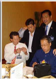
"A GREAT PHOTO!"