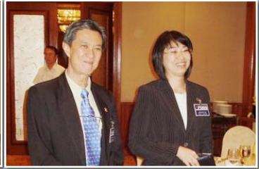
They helped to collect the 'Fines'