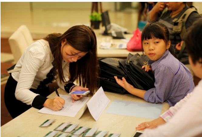
Rotaractors from the Rotaract Club of Pudu supported this project too