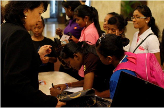
The orphan students and underprivileged students at the registration counter