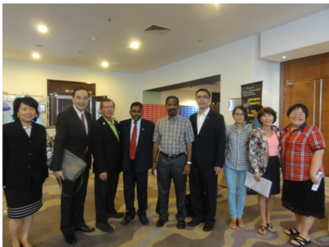
Committee Members with two Teacher Advisors