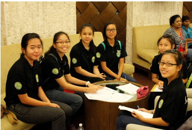
Interactors from SMK (P) Pudu were also present