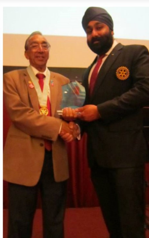
RC KL West