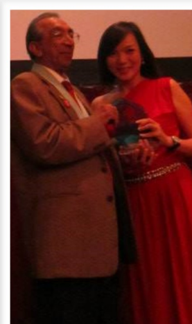
RC Petaling Jaya