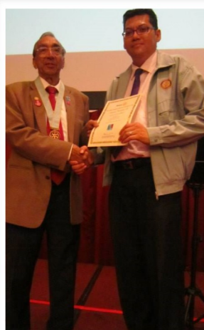
RC KL DiRaja