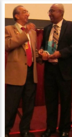
RC Bdr Sg Petani