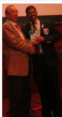
RC Greater KL