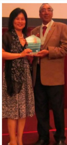
RC Bdr Utama