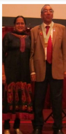
RC Kelana Jaya