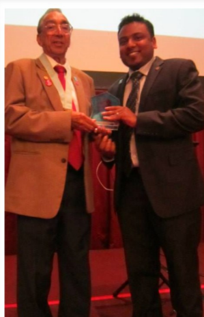
RC Central Damansara