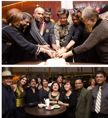
Sponsor clubs, Rotary Club of Melawati and Rotary Club of Bernam Valley.